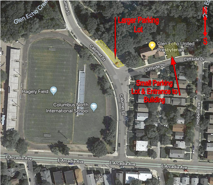
Glen Echo United Presbyterian Church—220 Cliffside Dr, Columbus, OH 43202