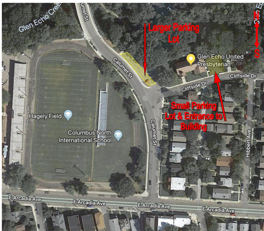
Glen Echo United Presbyterian Church—220 Cliffside Dr, Columbus, OH 43202