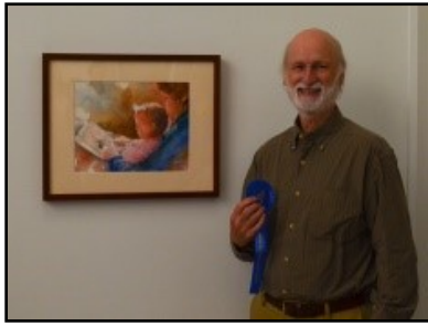
1 st Place