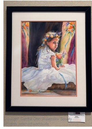
Honorable Mention: "Flower Girl at Orvieto Duomo (Italy)" by Pam Hartford