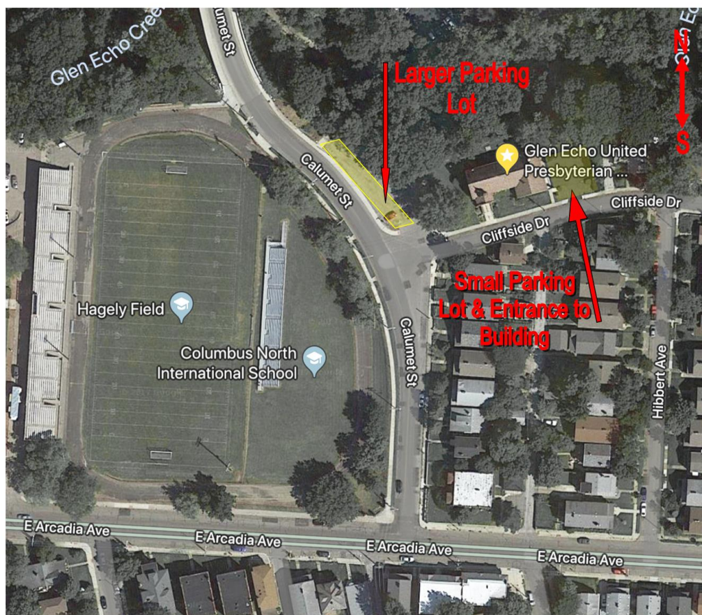
Glen Echo United Presbyterian Church—220 Cliffside Dr, Columbus, OH 43202